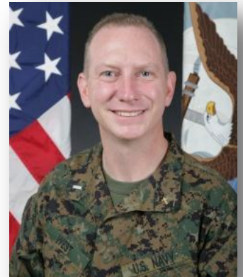
Lt. j.g. Bruce B. West