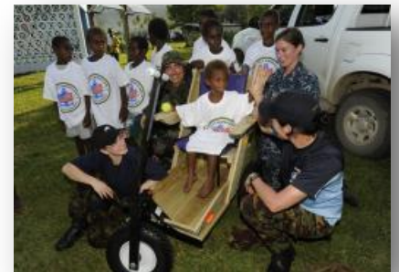
U.S. and New Zealand members of Pacific Partnership 2011 deliver a pull wagon for children donated by Project Hand Clasp and Later Day Saints during a Community Relations Project in the Port Olry village on the Island of Espiritu Santo, Vanuatu during Pacific Partnership 2011.

In Espiritu Santo, partner nations and non-government organizations of Pacific Partnership engaged in engineering, dental, medical and veterinary civil assistance projects and subject matter expert exchanges designed to increase