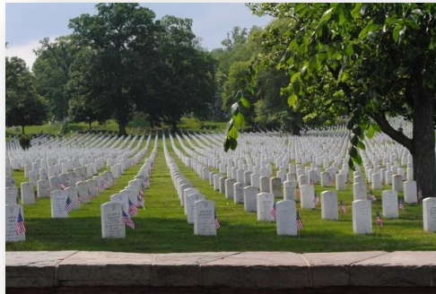
Arlington National Cemetery, pictured on Friday, May 27, 2011, is prepared for Memorial Day weekend with flags at each gravesite.