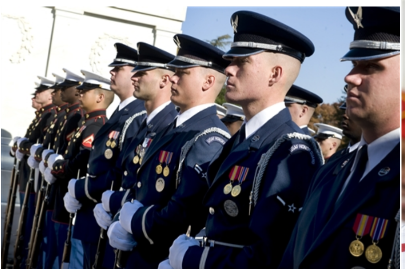
Joint Honor Guard members participate in a Veteran's Day ceremony at the Tomb of the Unknown Soldier at Arlington National Cemetery, Nov. 11, 2008.