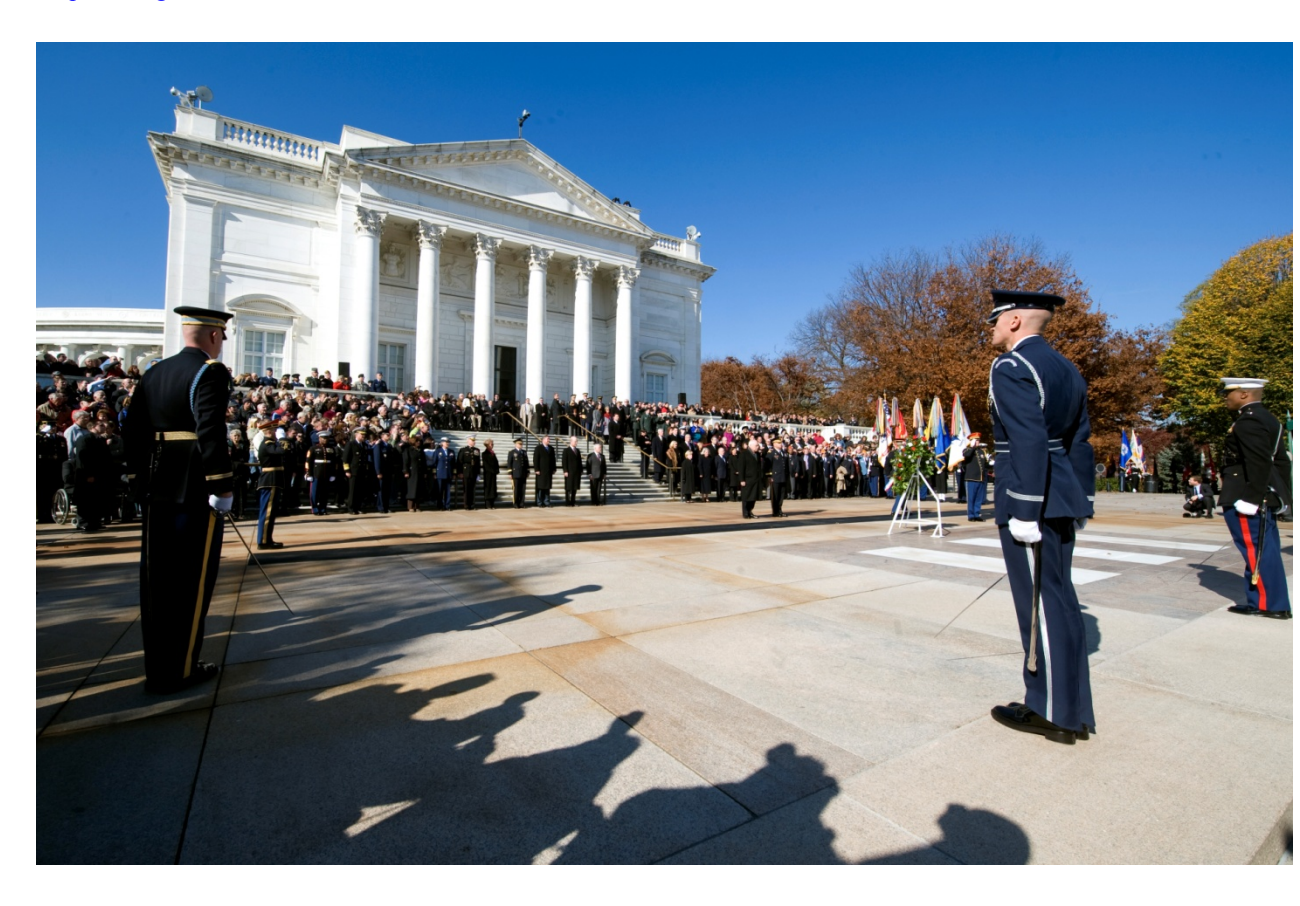
Veterans Day, 2008 at Arlington National Cemetery

Iraq and Afghanistan Veterans of America