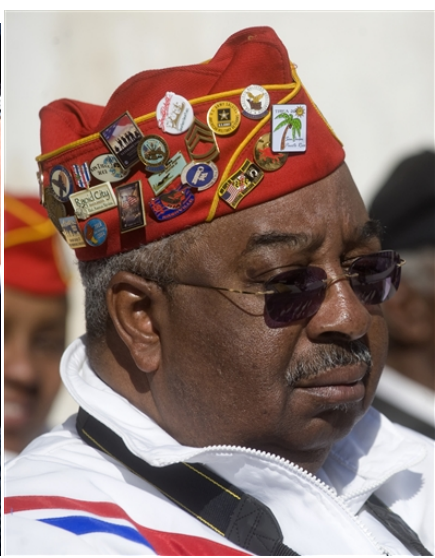
A U.S. veteran attends a Veteran's Day ceremony at the Tomb of the Unknown Soldier at Arlington National Cemetery, Nov. 11, 2008.