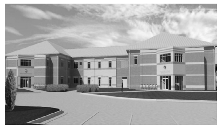
This graphic rendering depicts the building that will house the Air Force and Navy chaplain schools. In addition, the building includes a 300-seat auditorium and shared classrooms.

That's going to happen now, so we're excited about that," Hedges said. "It's going to be a good thing — coming together."