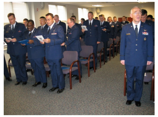
Final graduation ceremony of the Air Force Chaplain Service Institute while located at Maxwell – Gunter Air Force Base.