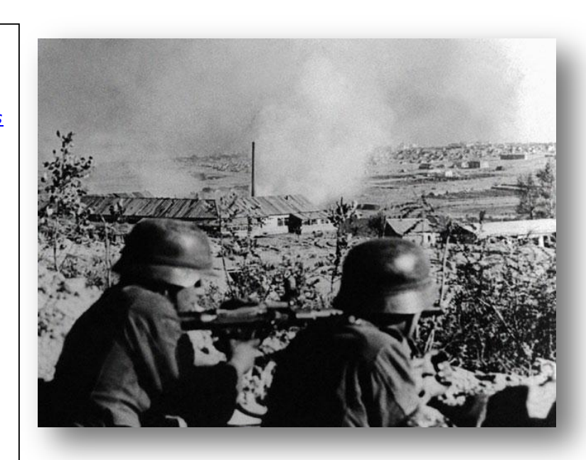
German soldiers during the battle of Stalingrad. Military chaplains performed their duties despite witnessing many horrific scenes throughout the war.

Please forward this newsletter to others and consider how you can make a difference for Chaplaincy by contributing to NCMAF/ECVAC through a designated offering.