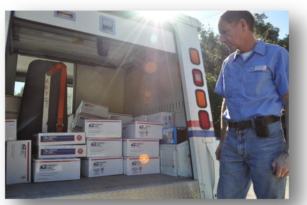
The boxes are ready to ship to overseas troops.

So he takes personal responsibility to see to it that the Bay Area chapter of Adopt-a-Chaplain has plenty of those unmentionables to send out in its care packages.