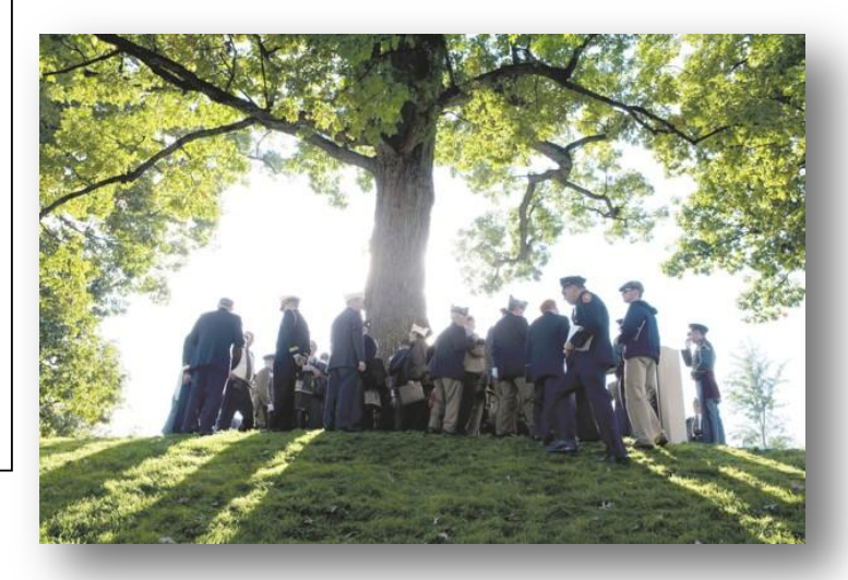
Mostly service members gather on Chaplains Hill at Arlington National Cemetery to view the new memorial for 14 Jewish chaplains who died in service to our nation after a dedication ceremony is held at the ampitheater Monday, October 24, 2011 in Arlington, VA.